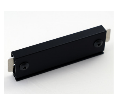
One gauge hanger bar