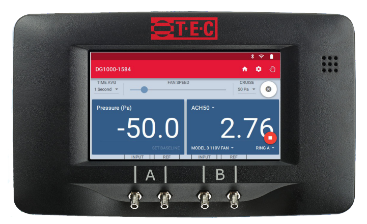
DG-1000 Pressure and Flow Gauge

The Minneapolis Blower Door System comes with a DG-1000 Pressure and Flow Gauge. It is a differential pressure gauge which measures the pressure difference between either of the input pressure taps and its corresponding reference pressure tap. It has two separate measurement channels which allow you to monitor the building pressure and fan pressure during a blower door test.