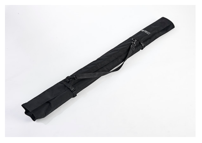
Carrying case for the frame