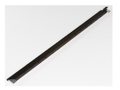
Two 96" vertical frame pieces